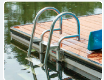
Angled Ladder $ 515