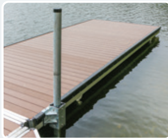
Edge Fender $ 13. 50 per foot installed