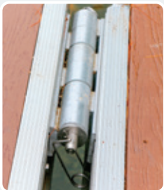
Hinge Connections as low as $ 449