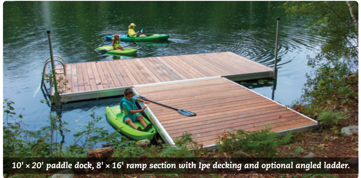
10' × 20' paddle dock, 8' × 16' ramp section with Ipe decking and optional angled ladder.

Please note: Our Aluminum Paddle Docks are not "stocked" items and do not qualify for Free Delivery or Pickup and Save. Please contact us for pricing and delivery/pickup time frames.