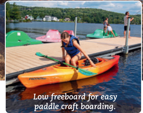
Heavy duty aluminum paddle dock at a State Park. Shown with optional vinyl edge fender and WearDeck decking in Barefoot Sand.