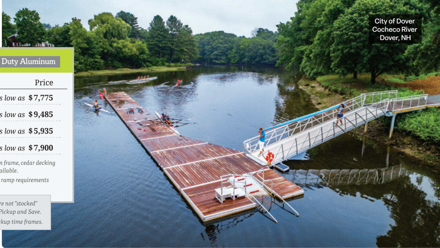
Above: Heavy duty aluminum frame Rowing Dock with 38' × 7' aluminum gangway and commercial kayak launch with ADA transfer platform (see page 57). Our custom pile dock serves as a shore anchor.

Please note: Our Aluminum Rowing Docks are not "stocked" items and do not qualify for Free Delivery or Pickup and Save. Please contact us for pricing and delivery/pickup time frames.