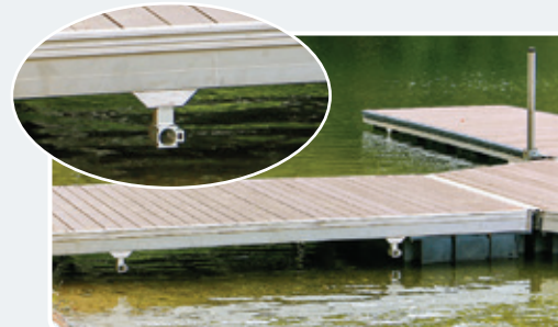
Axle & Wheel Mounts $1,095/set for seasonal installation & removal