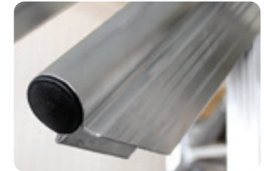
rounded aluminum handrail