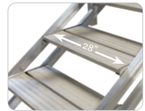
non-skid, 28" wide aluminum stair treads