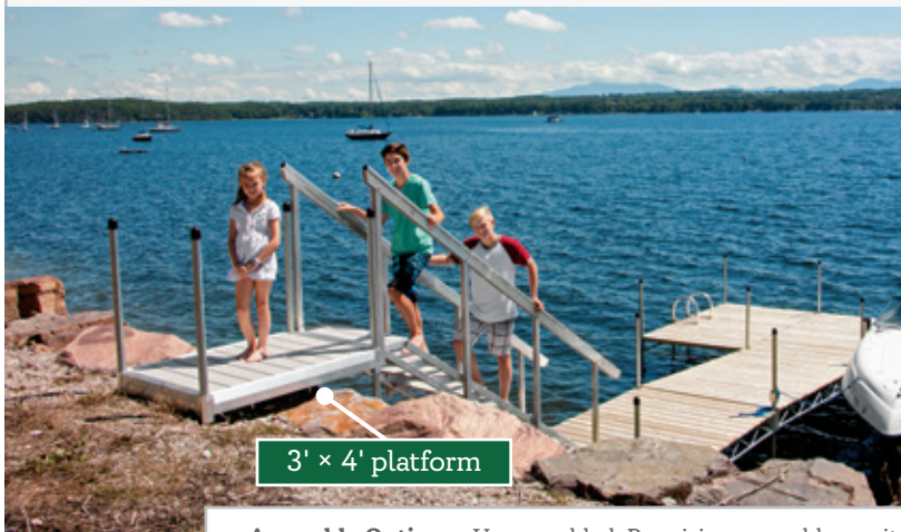
3' x 4' platform

Requires drilling stair on-site to mount.