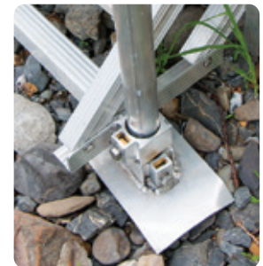
(optional) Adjustable Footpad $250 / pair

Requires drilling stair on-site to mount.