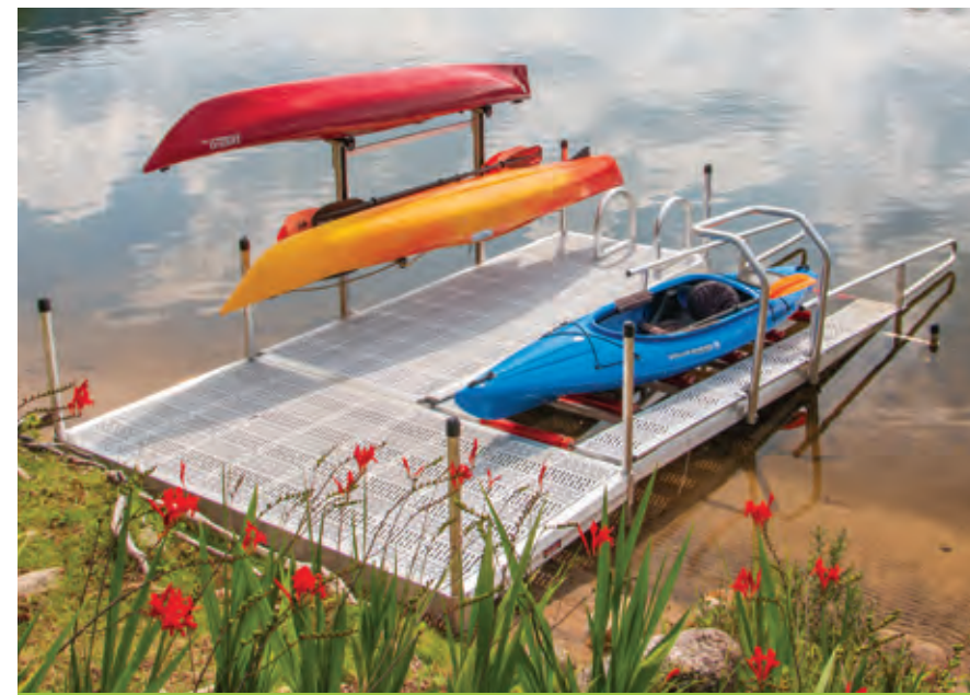
Our freestanding launch port system (see page 58 for more details)