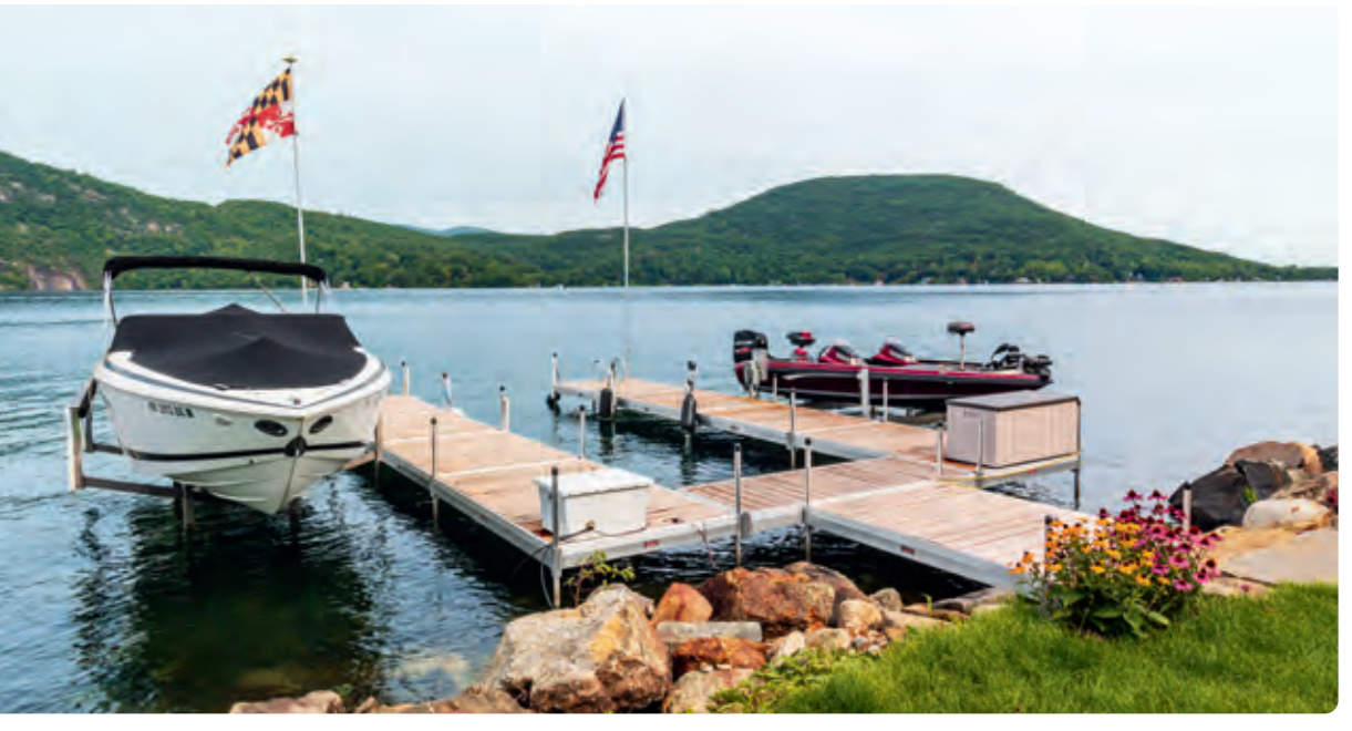
Above: Medium duty aluminum leg docks with cedar decking in a "U" shape. Below: "U" shaped configuration with WearDeck decking in Barefoot Gray.