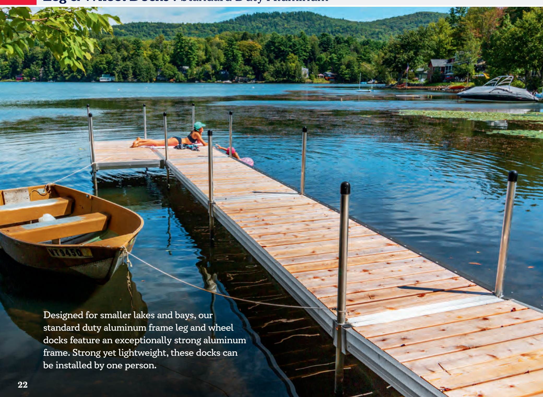
Leg & Wheel Docks: Standard Duty Aluminum