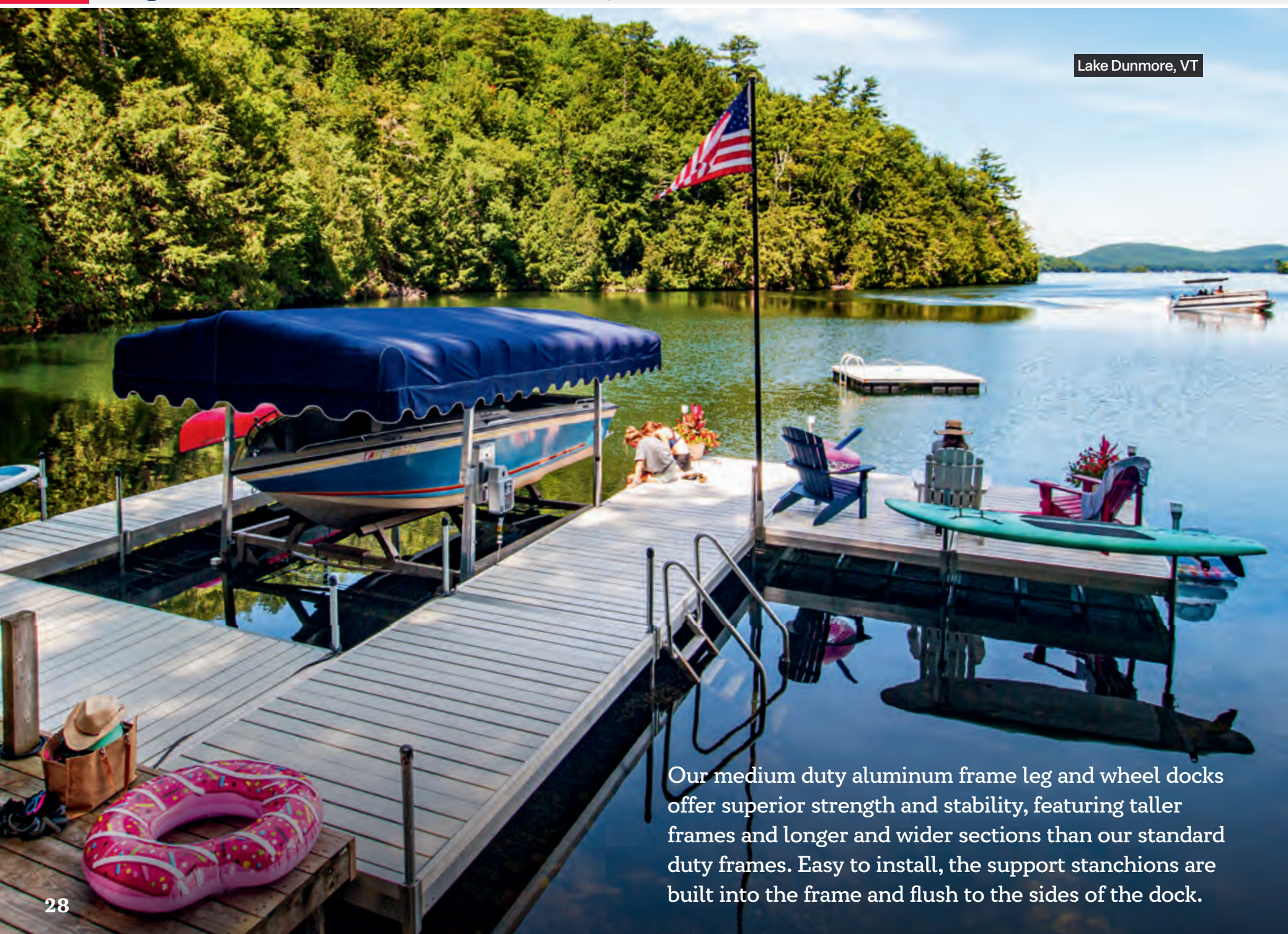
Leg & Wheel Docks: Medium Duty Aluminum