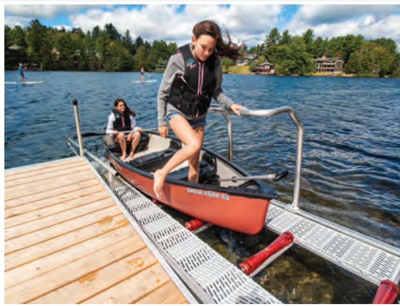
Above & Above Left: Standard duty aluminum docks with cedar decking and our freestanding launch port system (see page 58 for more details).