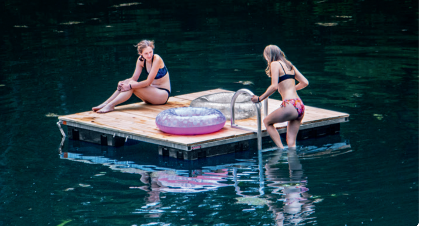
8' × 8' galvanized steel swim float with cedar decking.