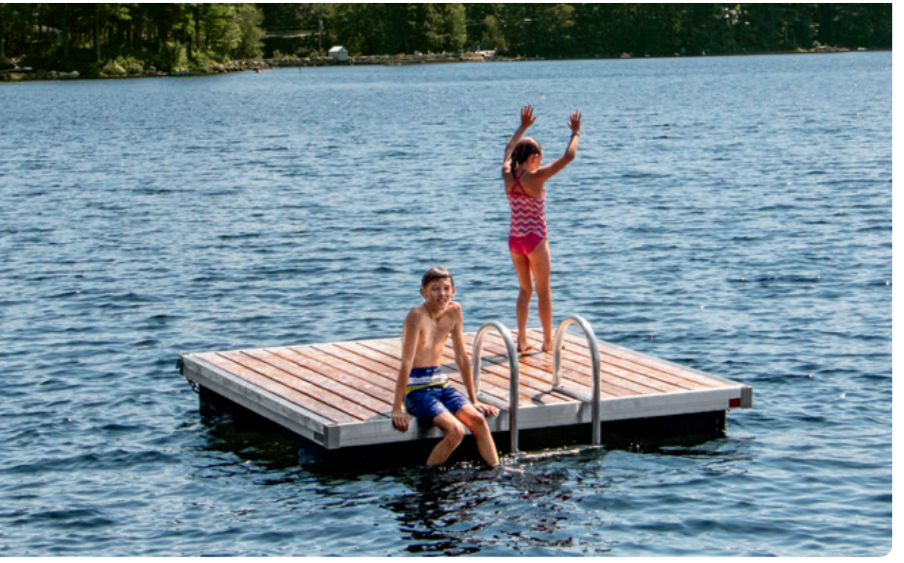
8' \times 8' aluminum swim float with cedar decking.