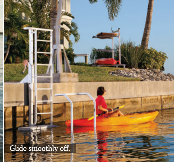
Glide smoothly off.