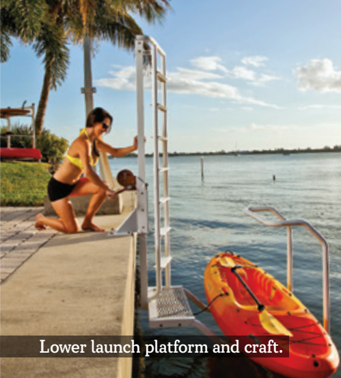
Lower launch platform and craft.