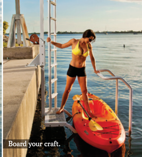
Board your craft.