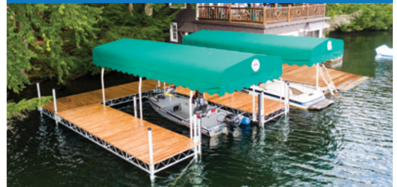
Custom aluminum canopy mounts to attach standard RGC canopies to our Mega dock