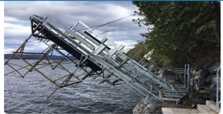
Above: Our Ultimate Lift customized to attach to the shore with galvanized lift arms allowing it to be raised for winter storage.