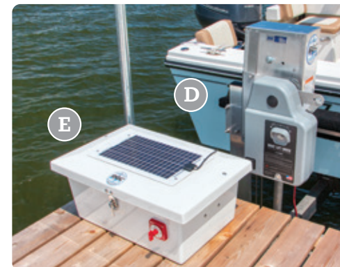
Extreme Max D/C drive with remote control and solar power box

F Elevated Power Box Stand This stand provides protection for your power box from heavy wave action or high water. Aluminum frame provides 15" of height above the deck surface. $ 1,630 Power box not included in price.