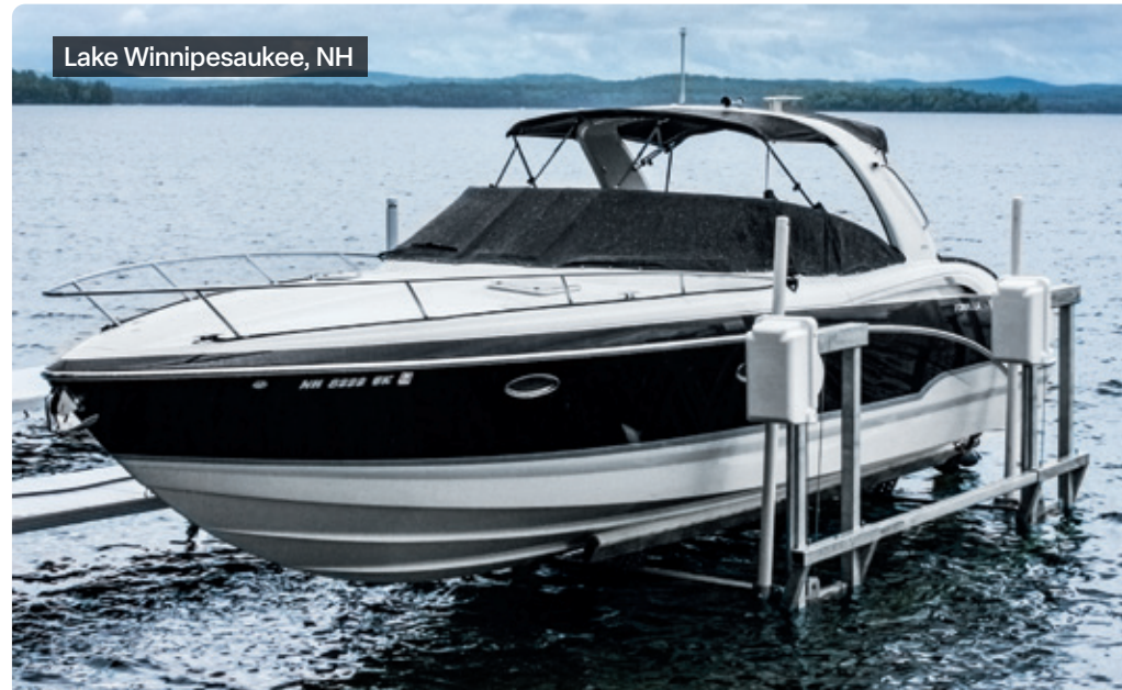
Lake Winnepesaukee, NH