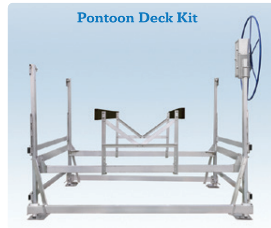
Pontoon Deck Kit