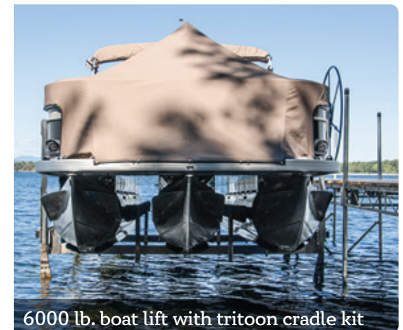
6000 lb. boat lift with tritoon cradle kit