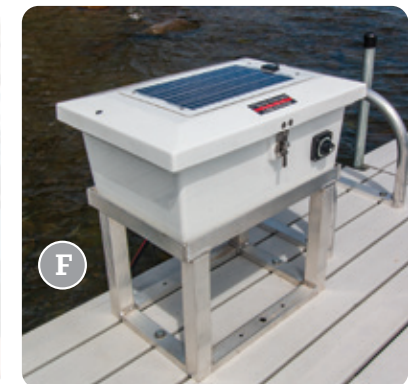
Elevated power box stand