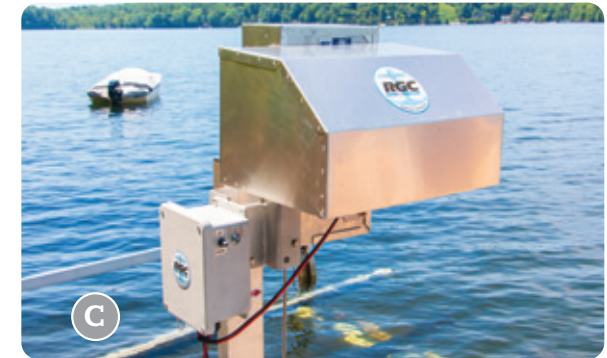
Direct A/C drive with manual switch

Note: Drives listed are for lifts with R18 winches only. Please inquire for pricing and information on electric drives for D&L winches.