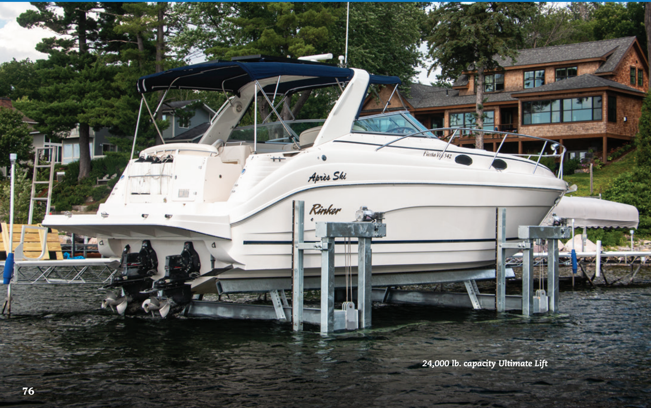
24,000 lb. capacity Ultimate Lift

Ideal for boats from 6,000 to 32,000 lbs, our Ultimate Vertical Boat Lifts are manufactured with industrial quality hot-dipped galvanized steel. This lift is designed to be used in shallow, deep and fluctuating water applications. The 12,000 lb. and larger models are custom fabricated in modular sections for ease of seasonal handling.