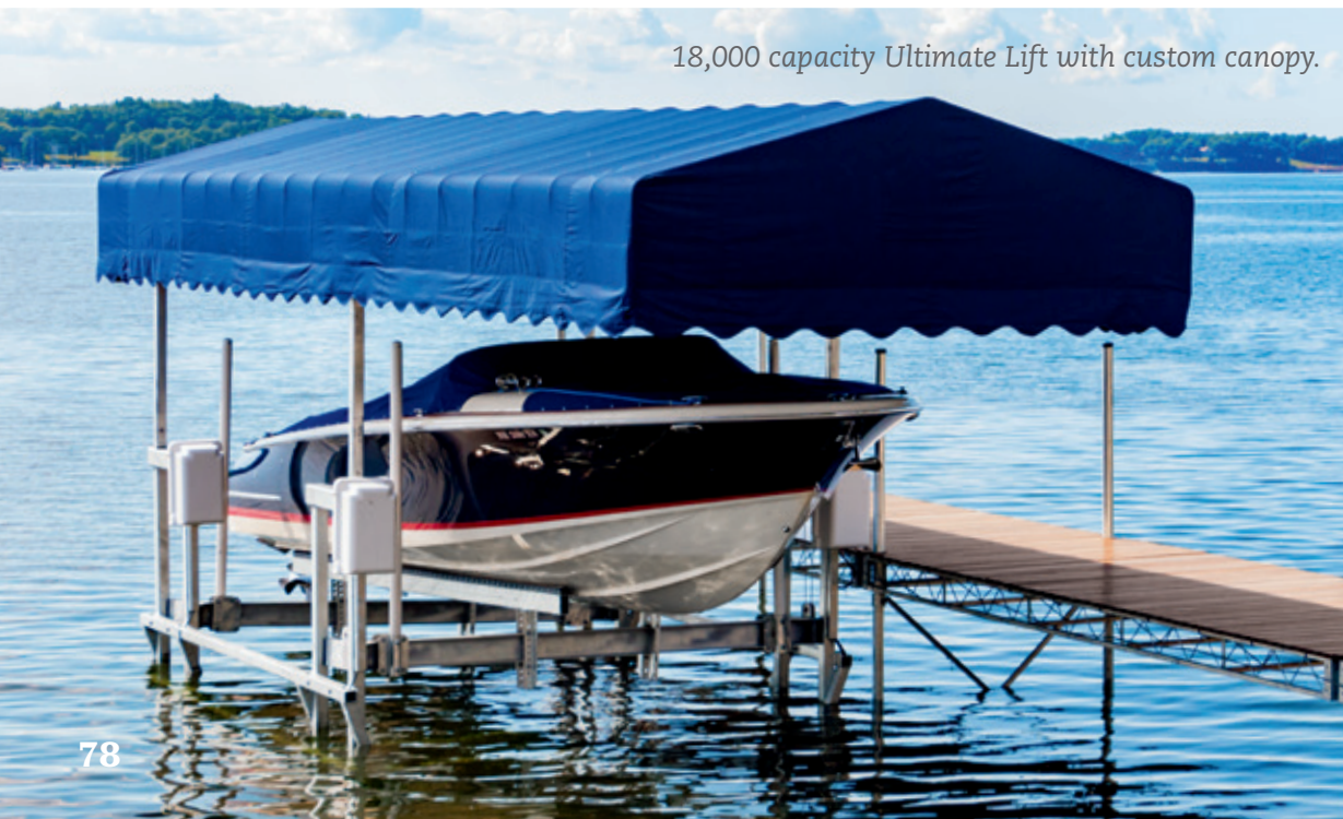
18,000 capacity Ultimate Lift with custom canopy.

AC drives and Gem remote controls are standard features on our Ultimate Lifts.