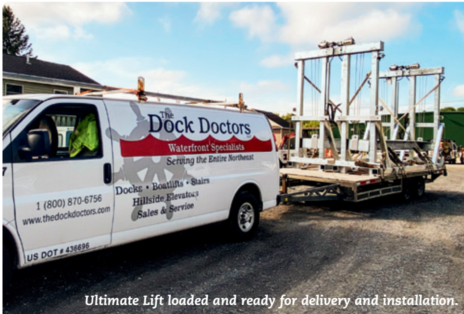
Ultimate Lift loaded and ready for delivery and installation.

Above: 24,000 lb. capacity Ultimate Lift with custom front end bow stop & optional oil bath drives. Below: 15,000 lb. capacity Ultimate Lift with standard 7' vertical guide poles with PVC sleeves.