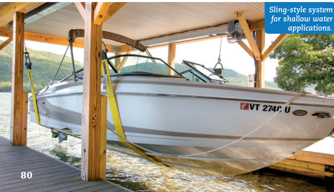
Sling-style system for shallow water applications.