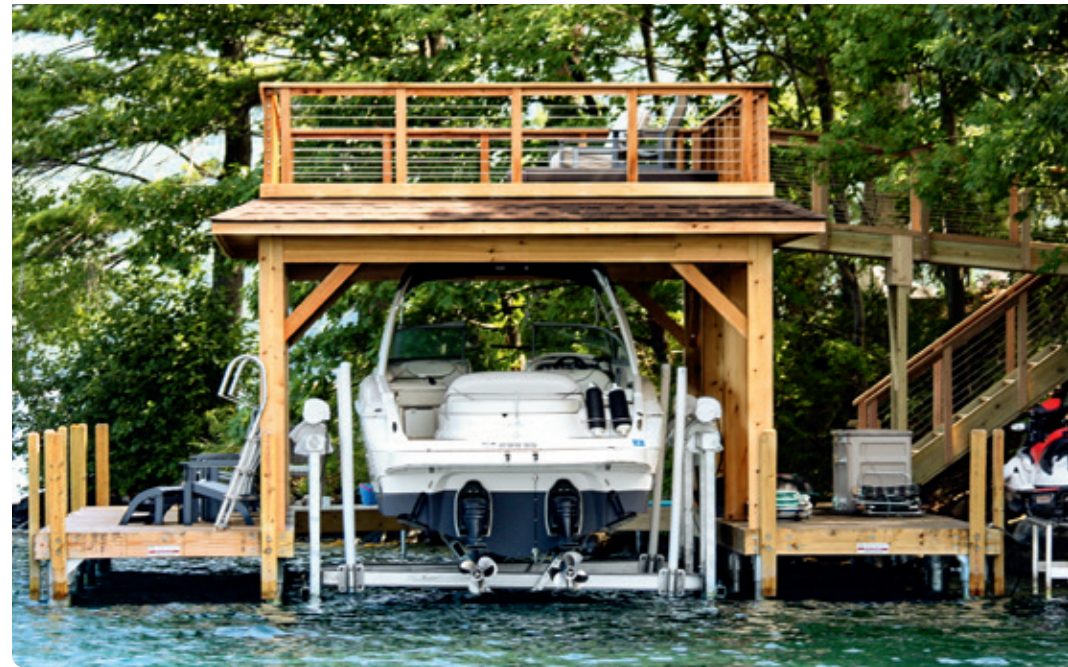
Above: 12,000 lb. capacity Ultimate Lift installed in a slip within a boathouse with standard vertical guides & upgraded oil bath drives.