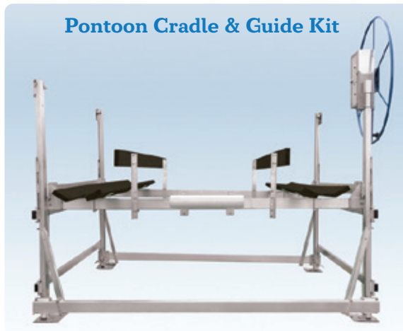
Pontoon Cradle & Guide Kit