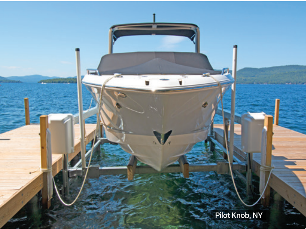
Pilot Knob, NY