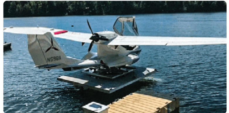
Above: Seaplane lift utilizing a stock hydraulic lift with a custom turntable platform.