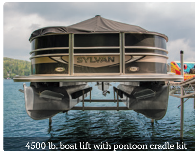
4500 lb. boat lift with pontoon cradle kit

See page 73 for pricing and details on the pontoon and tritoon cradle kits.