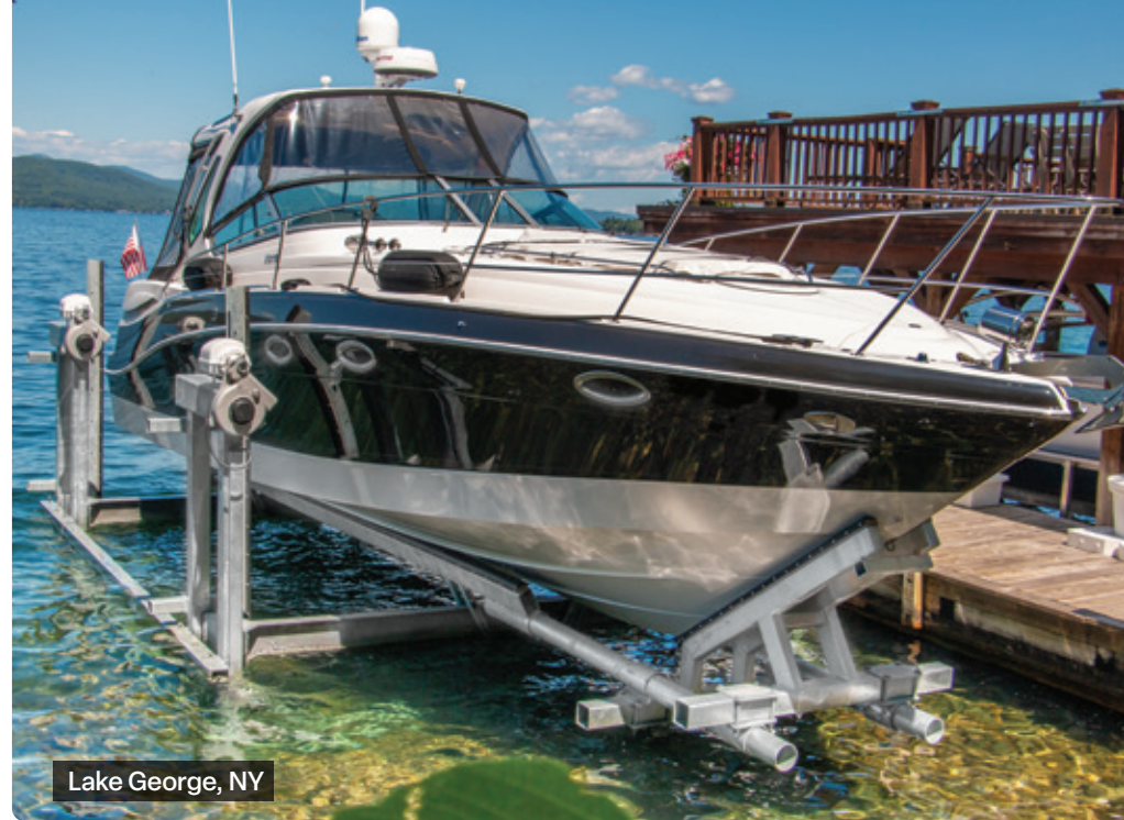
Lake George, NY

Above: 24,000 lb. capacity Ultimate Lift with custom front end bow stop & optional oil bath drives. Below: 15,000 lb. capacity Ultimate Lift with standard 7' vertical guide poles with PVC sleeves.