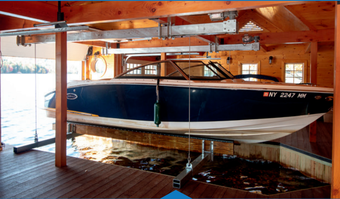
Above: Bunk-style cradle system with pull-out tubes in place for winter storage.

We custom fabricate Lifts for all types of sites & situations: For more information, visit our website at: www.thedockdoctors.com/custom-boat-lifts